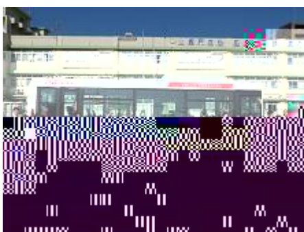
Commemorative photo with the DeuSEL® bus.